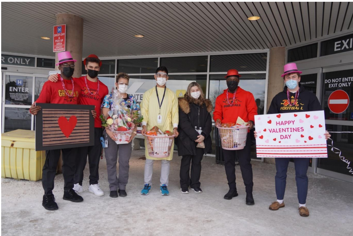
Pictured: Gryphon Players and Frontline Workers at Guelph General Hospital

Watch the highlights from our Valentine's Day visit here .