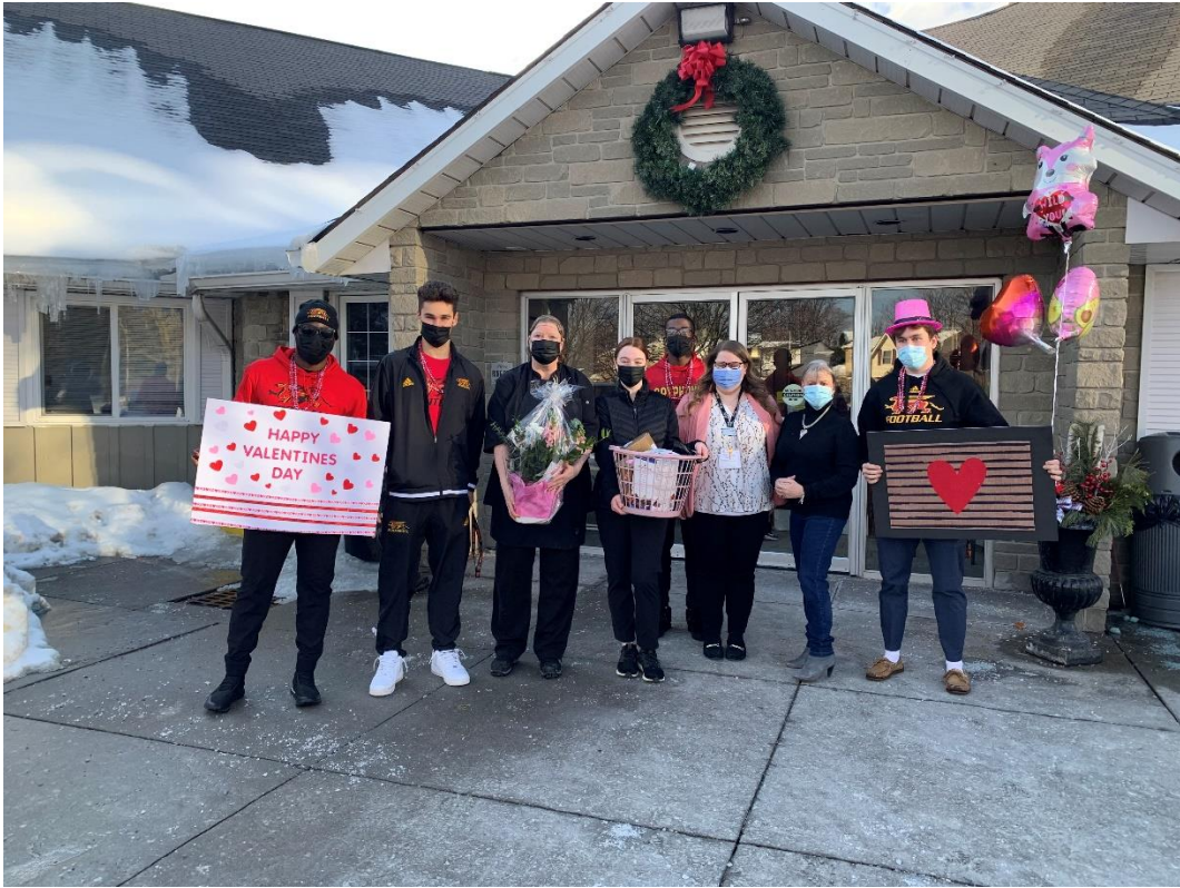
Pictured: Gryphon Players and Frontline Workers at Stone Lodge Retirement Residence