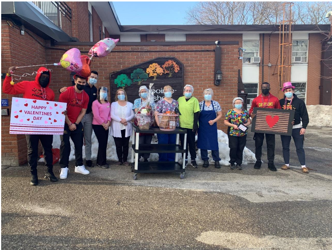
Pictured: Gryphon Players and Frontline Workers at Lapointe-Fischer Nursing Home