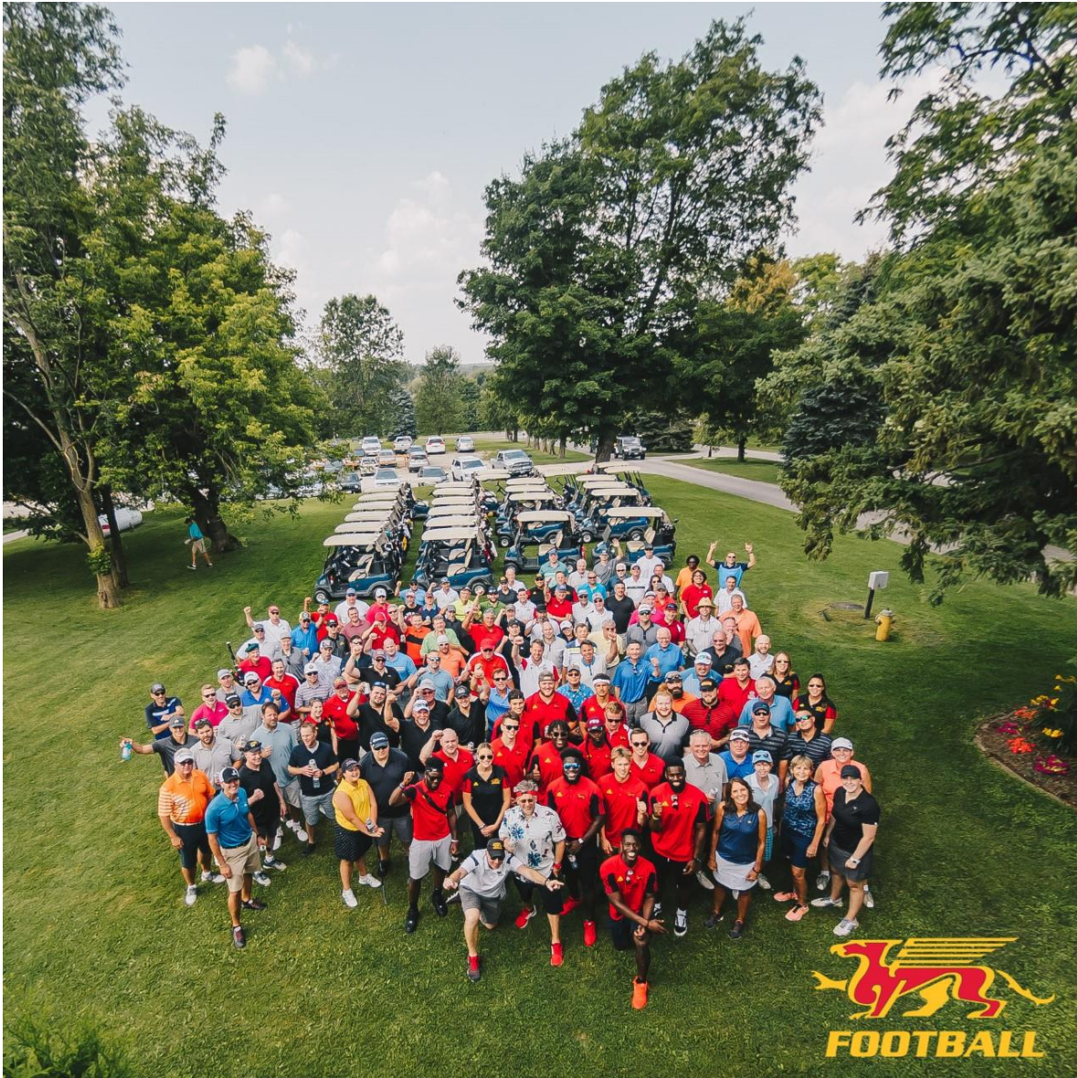
FOGF Golf Tournament