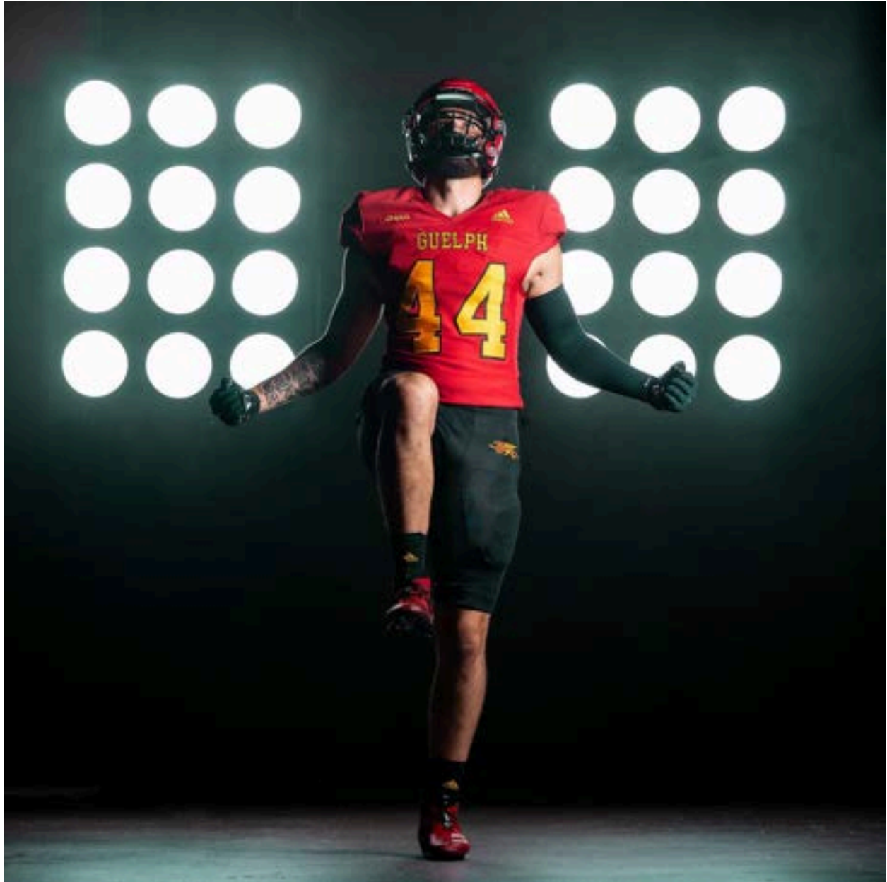
That feeling when exams are over for the semester

As of December 15th, 2023, all final exams came to a close, and the Gryphons officially broke for the holidays. We would like to congratulate the team on a successful fall semester of studies, and wish them all the best heading into their Winter 2024 term. Classes resume for the Gryphons on January 8th, 2024.