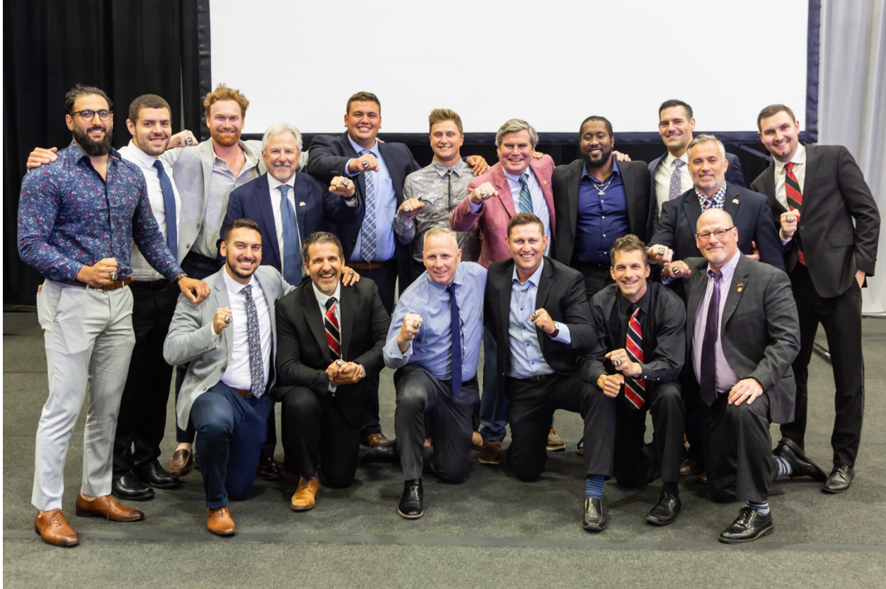
Pictured: Players and coaches from the 2015 Yates Cup Championship Team