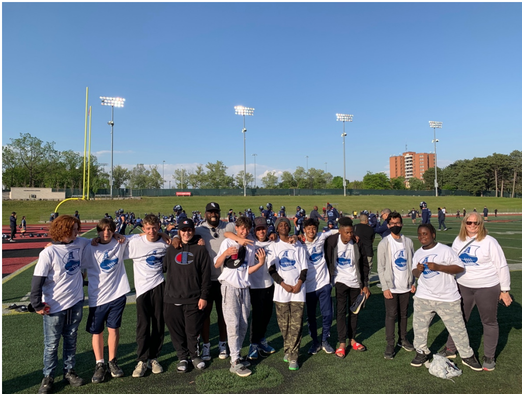
Pictured: Students from Willow Road Public School