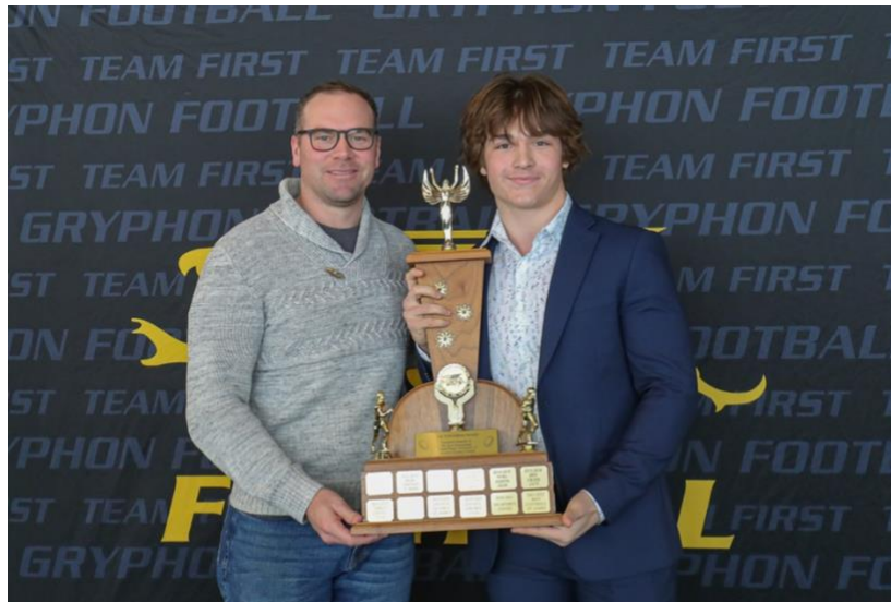
The Nick FitzGibbon Award - MVP