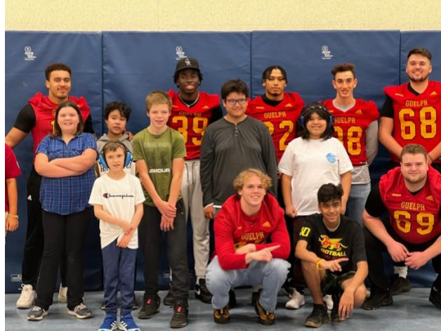
Pictured: Students from John Galt Elementary Schools and Gryphon Football Players