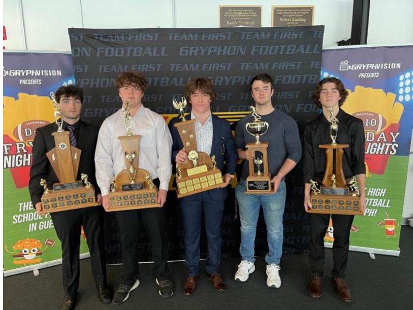
Major Award Winners