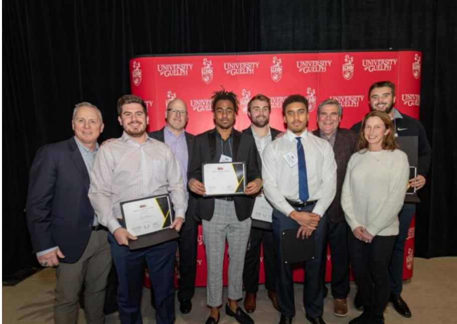
Recipients of the FOGF Scholarships