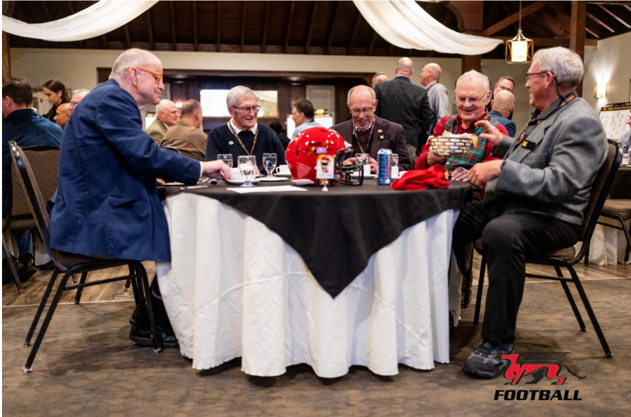
Pictured: Players from the Team of the Decade from the 1950's and 1960's