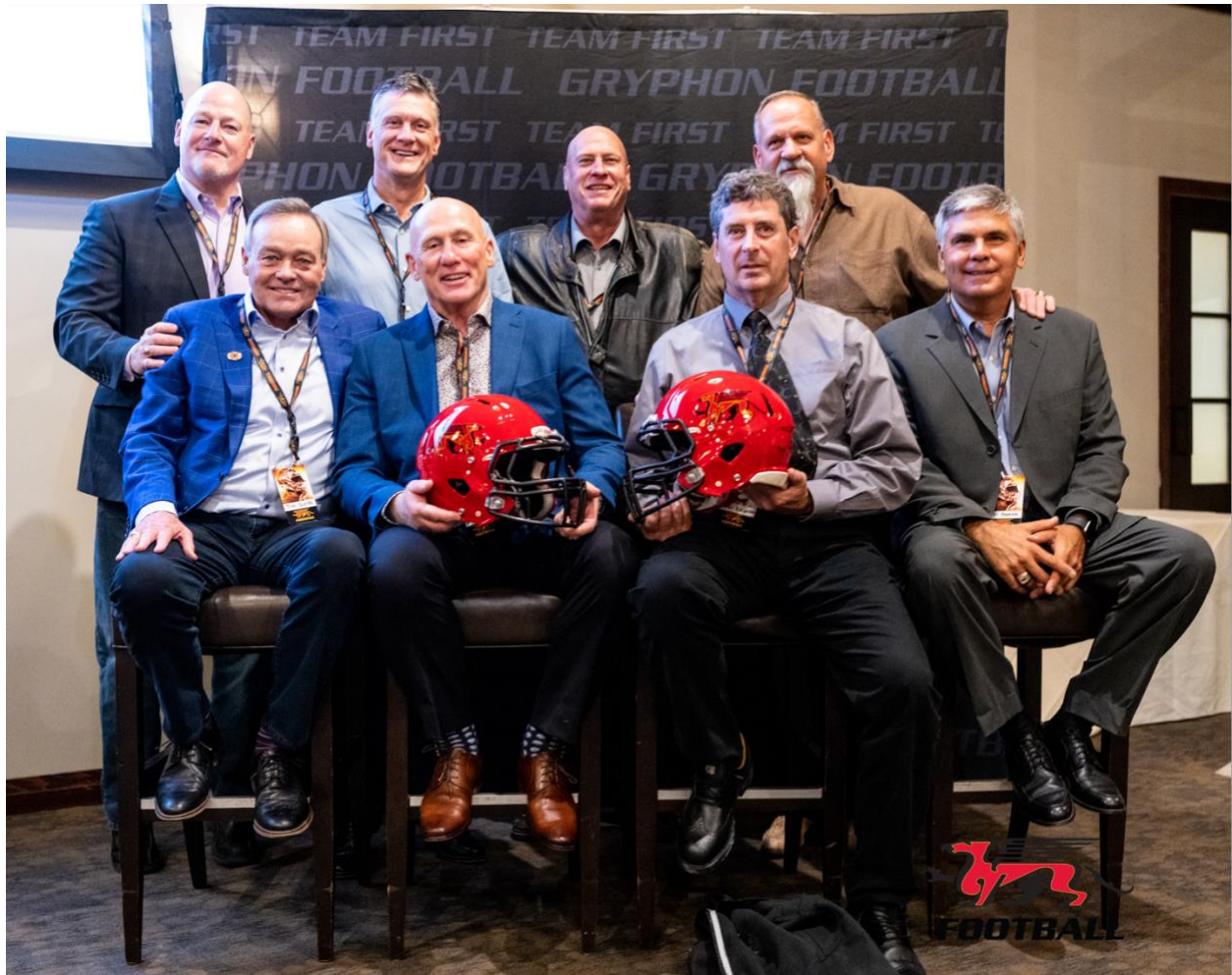
'84 Vanier Cup Champions in Attendance