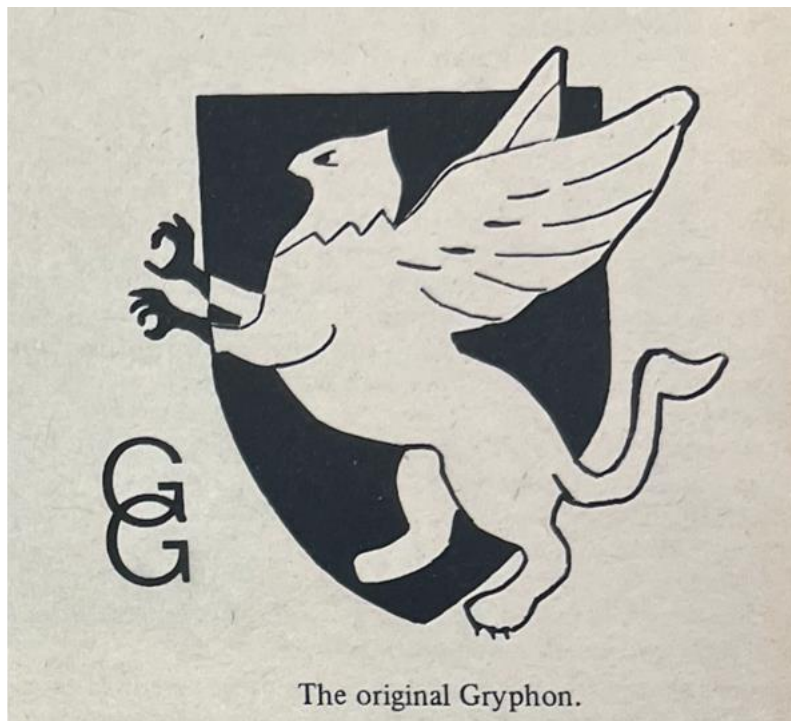
The original Gryphon.